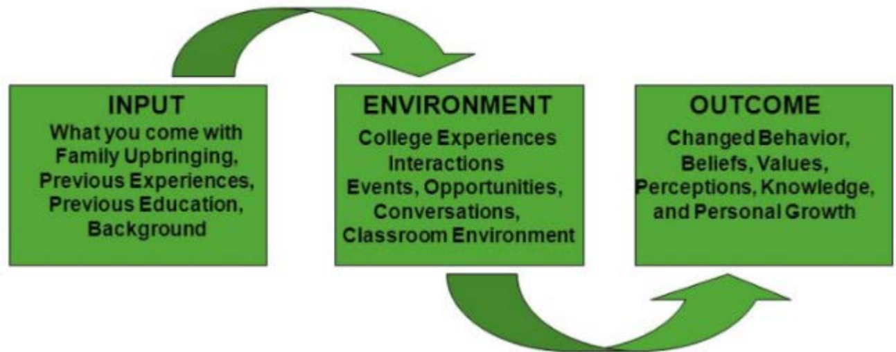
Figure 2: Theory of Student Involvement